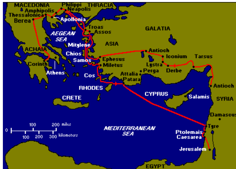
3 rd Trip