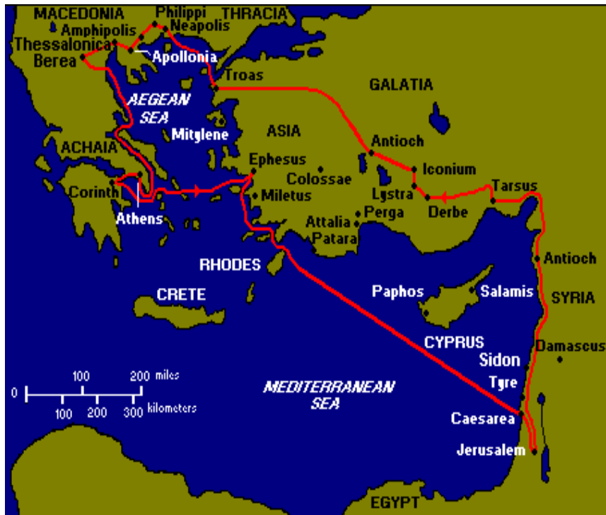
2 nd Trip