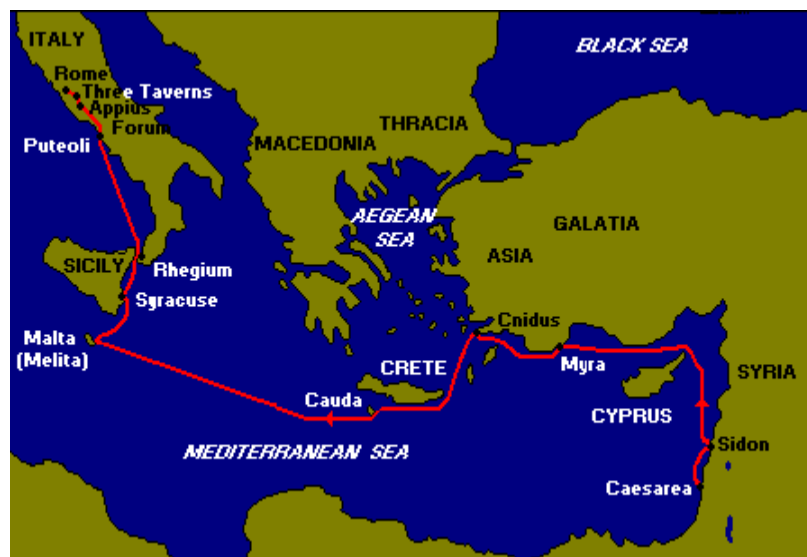
4 th Trip