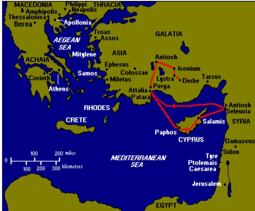
1 st Trip